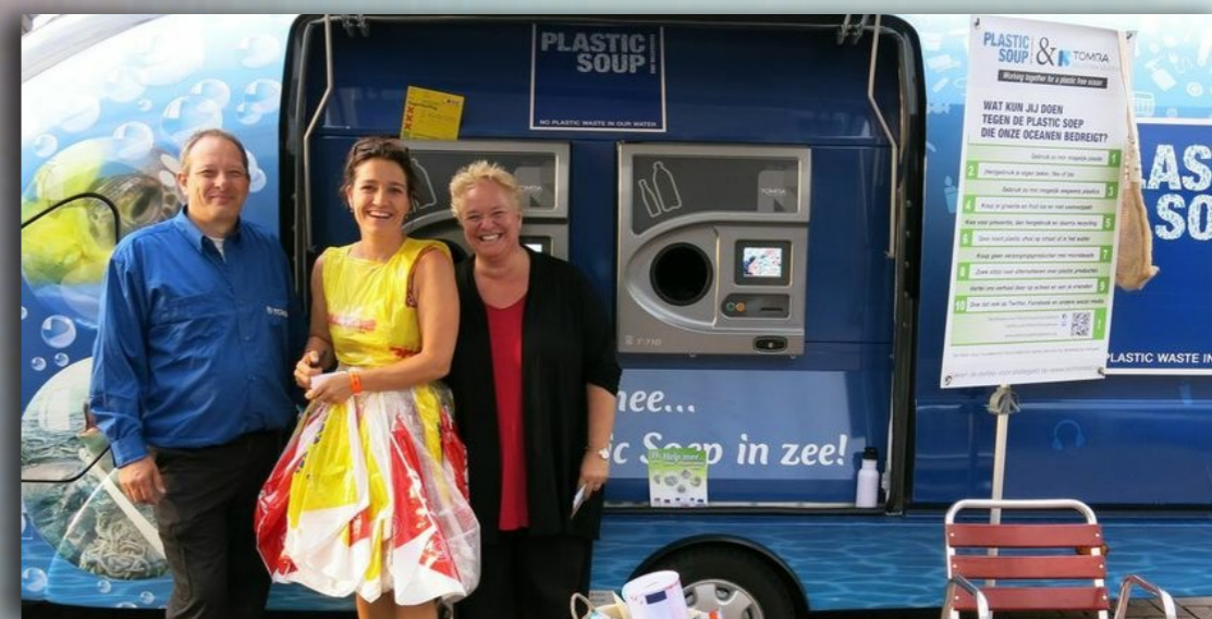
top: Seeds, North Carolina bottom: Plastic Soup Foundation, Amsterdam