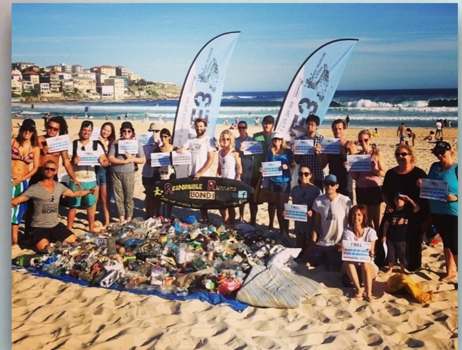
Responsible Runners - Bondi Beach, Australia

Fans committed to make the switch to using reusable bags and water bottles.