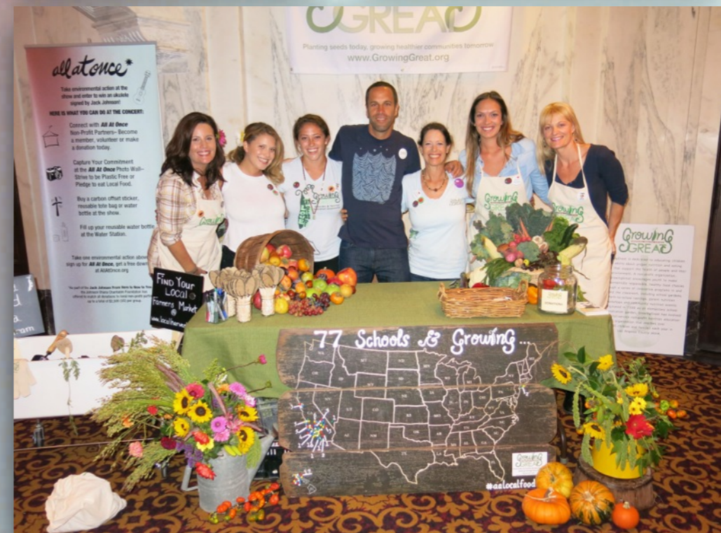
Growing Great - Los Angeles, CA